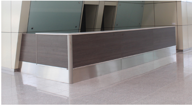
DINOX boarding counter | Houari Boumediene Airport, Algeria